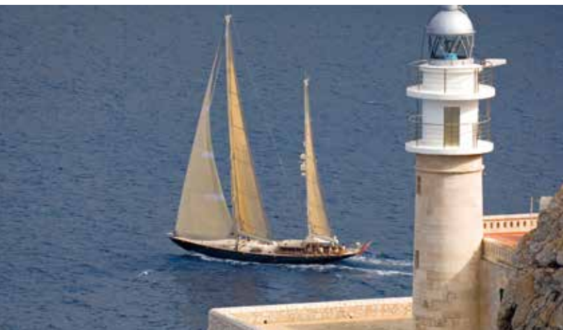
Claasen superyachts are found on the seven seas.