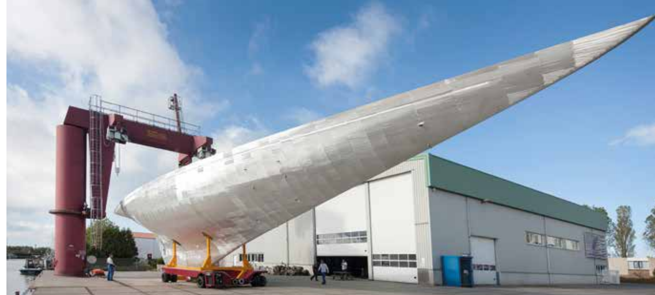
The hull of J Class Svea at our aluminium facility