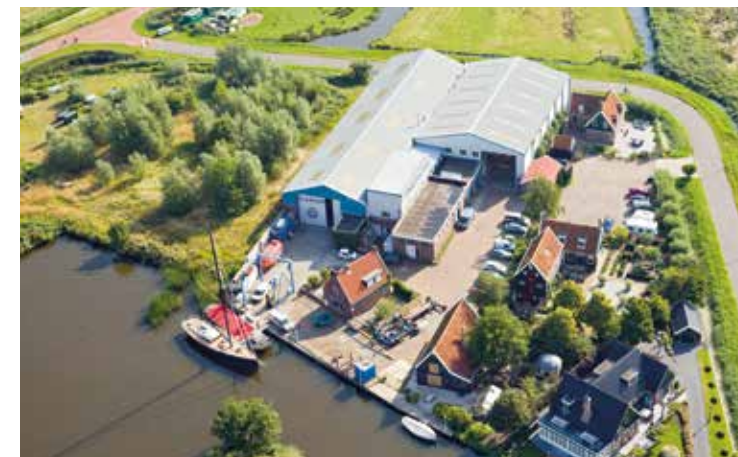
The facilities at Makkum (left) and Zaandam are easy to reach and state of the art.

Less than an hour north, our second facility in Makkum is specialised in the construction of aluminium hulls for luxury superyachts. Each hull is custom-built and quality is assured by meeting all the requirements of class societies such as Lloyds and ABS. The yard has a direct connection to the IJsselmeer lake and has created the modern underwater hulls for many Truly Classic yachts, playing an important part in the success of this concept.