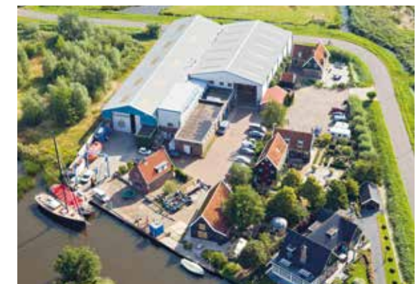
The facilities at Zaandam.

If you would like to find out more in person, why not arrange a visit to the yard: We are only 20 minutes from Amsterdam Schiphol Airport and would love to show you around our facilities. Who knows, you too may soon find yourself at the wheel of your very own Claasen yacht. In the meantime, we are proud to introduce to you the beautiful Perseverance .