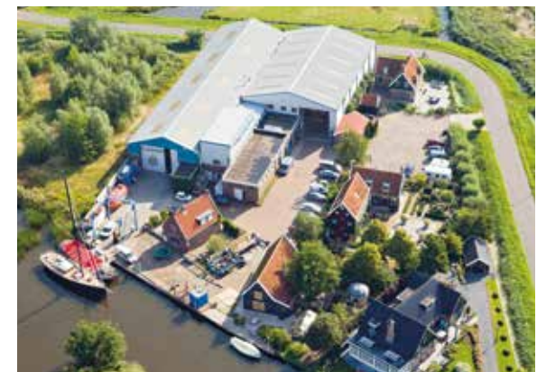
The facilities at Zaandam.

If you would like to find out more in person, why not arrange a visit to the yard: We are only 20 minutes from Amsterdam Schiphol Airport and would love to show you around our facilities. Who knows, you too may soon find yourself at the wheel of your very own Claasen yacht. In the meantime, we are proud to introduce to you the beautiful Firefly .