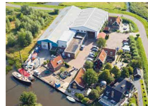
The facilities at Zaandam.

If you would like to find out more in person, why not arrange a visit to the yard: We are only 20 minutes from Amsterdam Schiphol Airport and would love to show you around our facilities. Who knows, you too may soon find yourself at the wheel of your very own Claasen yacht. In the meantime, we are proud to introduce to you the beautiful Heartbeat .