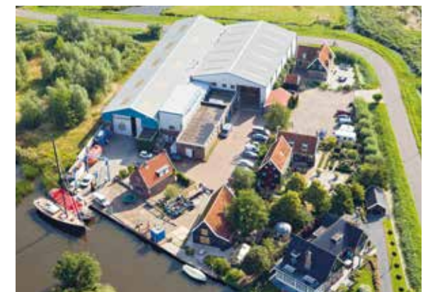
The facilities at Zaandam.

If you would like to find out more in person, why not arrange a visit to the yard: We are only 20 minutes from Amsterdam Schiphol Airport and would love to show you around our facilities. Who knows, you too may soon find yourself at the wheel of your very own Claasen yacht. In the meantime, we are proud to introduce to you the beautiful Velacarina .