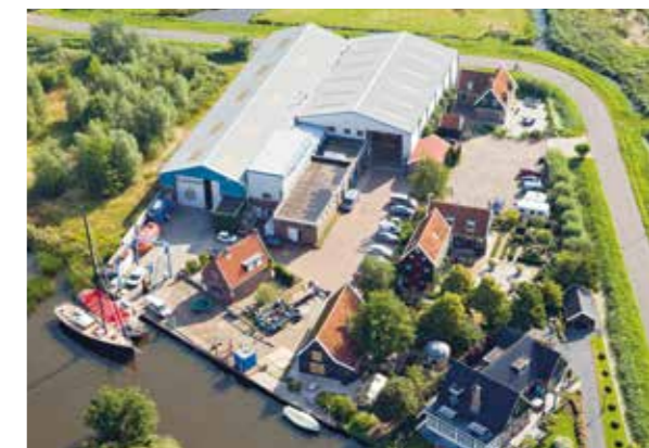
The facilities at Zaandam.

If you would like to find out more in person, why not arrange a visit to the yard: We are only 20 minutes from Amsterdam Schiphol Airport and would love to show you around our facilities. Who knows, you too may soon find yourself at the wheel of your very own Claasen yacht. In the meantime, we are proud to introduce to you our latest launch, the awesome Acadia .